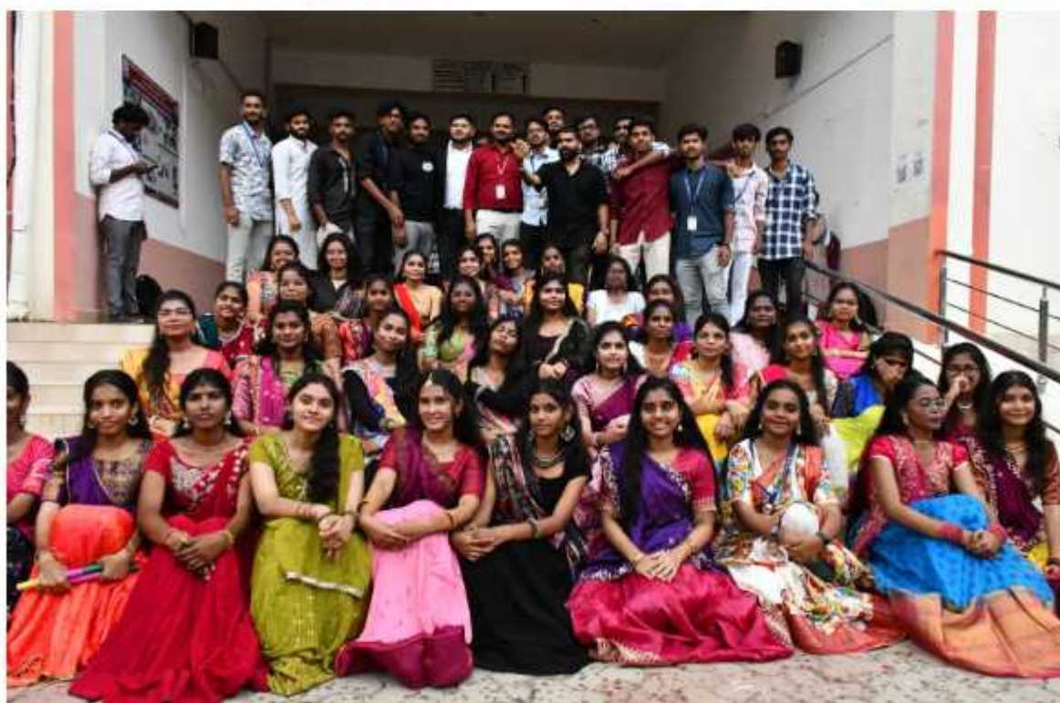
Outcome of the Event: