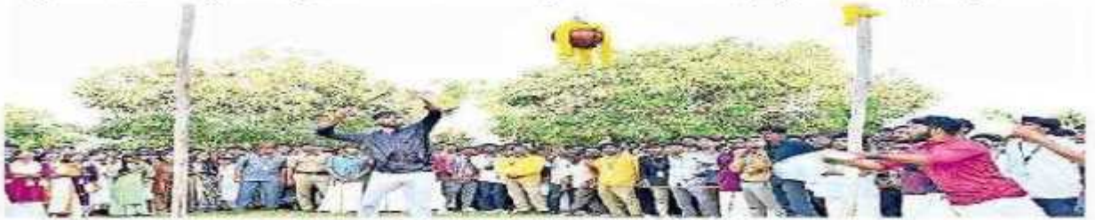
ఉట్టి కొడుతున్న విద్యార్థులు